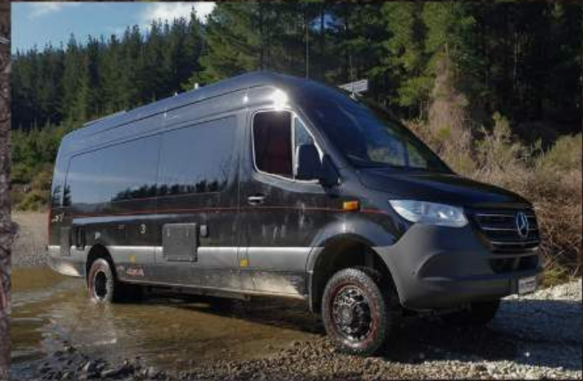
Daisy's 2020 DarkStar Mercedes Sprinter. Loaded with every option. The ultimate camper van and perfect for rugged environments.