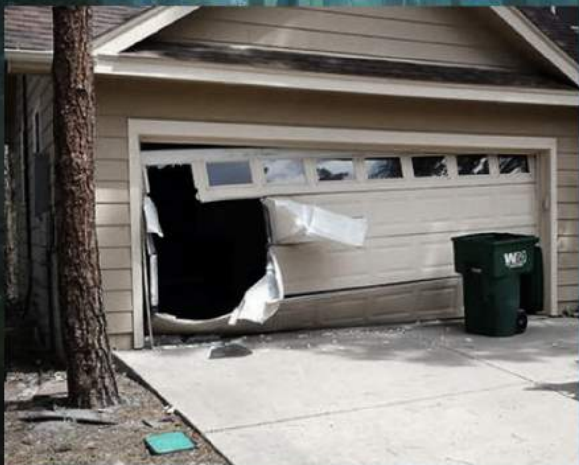
The Grizzly's attempt to get into the house.