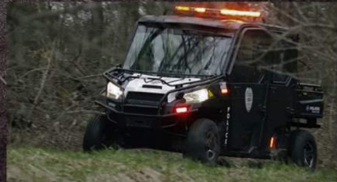
Tubbs' Polaris Razor-D4, Turbo. Military grade all-terrain UTV. Perfect for on and off-road mountain patrol.