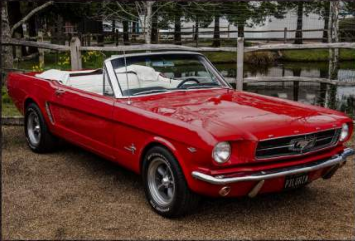
Reegan's rare Shelby GT 1967 Mustang. Vintage; refitted leather seats and steering wheel. The ultimate convertible.