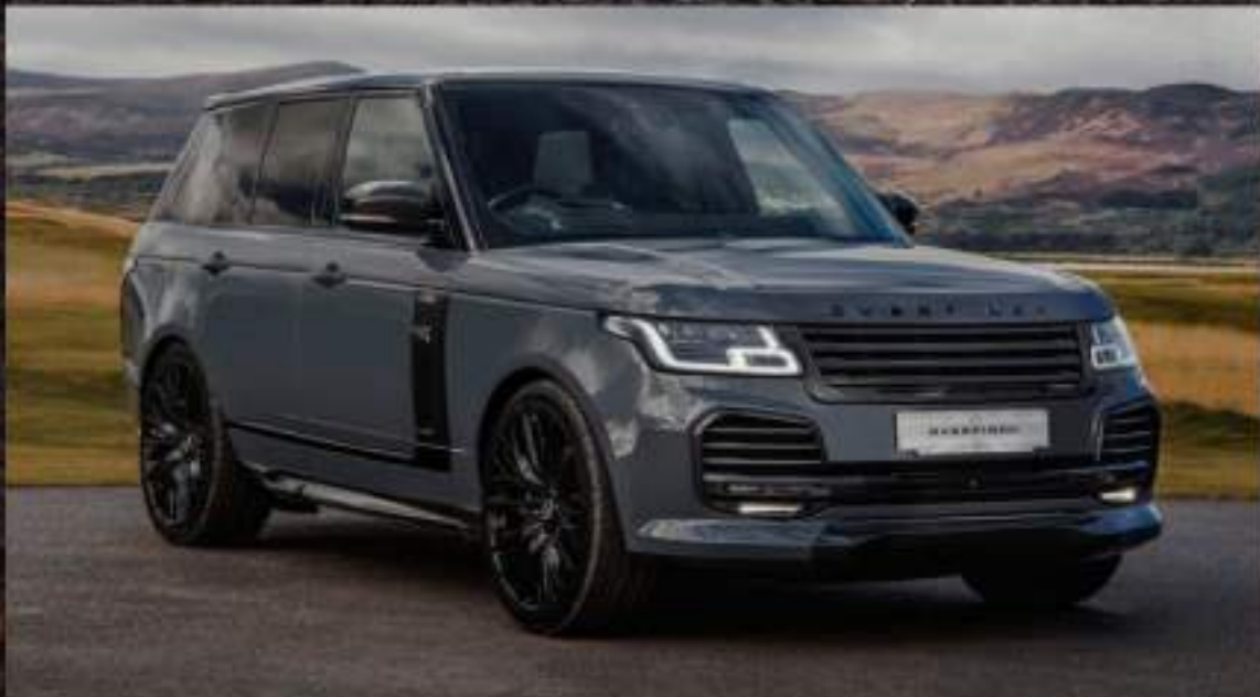
Ted's Range Rover Overfinch - Manhattan edition. An aftermarket luxury SUV. Pleated, bespoke leather seats and a massive moonroof. Dealer plates. Cherry-wood features. Over the top opulence.